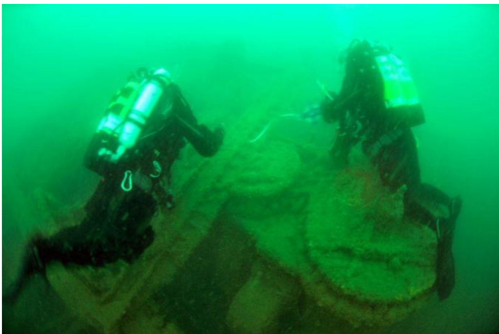
Figure 4: Divers measuring the engine pots

Forward of the engine lie the two boilers and there is also a donkey boiler present (a small boiler which is used to run the ships auxiliary engines when the main boilers are cold) (Figure 5).