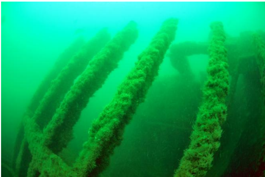
Figure 6: Ribs on Port side

On travelling towards the stern of the vessel the remains begin to flatten as more ribs become apparent and the sides of the vessel are collapsing (Figure 6). Lots of structure is still recognisable including hatches and combings but further dives would be required to generate a full plan of the vessel. Go pro video footage was taken by divers around the wreck and a short annotated video tour produced and posted on You Tube (Maritime Archaeology Trust, 2017). The deck is evident in many places and its possible to look down amongst the fallen structure into the holds.