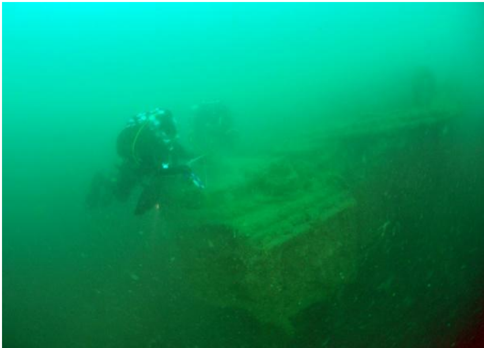
Figure 3: Divers at the triple expansion engine

highest part of the wreck stands around 6m high which is the boiler and the triple expansion engine which can be seen in Figure 3. The approximate measurements of the three pots of the engine (in diameter) are 50cm first pot, 80cm middle pot and 122cm top pot (Figure 4).