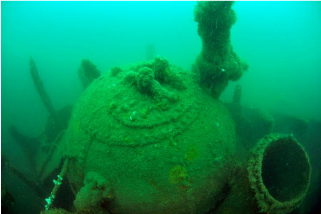
Figure 5: Donkey boiler

On travelling towards the stern of the vessel the remains begin to flatten as more ribs become apparent and the sides of the vessel are collapsing (Figure 6). Lots of structure is still recognisable including hatches and combings but further dives would be required to generate a full plan of the vessel. Go pro video footage was taken by divers around the wreck and a short annotated video tour produced and posted on You Tube (Maritime Archaeology Trust, 2017). The deck is evident in many places and its possible to look down amongst the fallen structure into the holds.