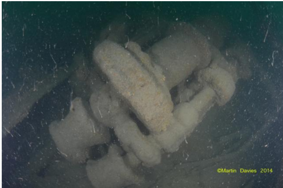
Figure 7: Winch near the stern

Towards the stern a deck winch lies with two bollards nearby (Figure 7). At the stern, the bronze propeller is reported to have been raised by salvage divers and it had two blades missing (Wendes, 2006). No armament is present as SS Molina was sailing under the neutral flag of Norway, and therefore, was unarmed.