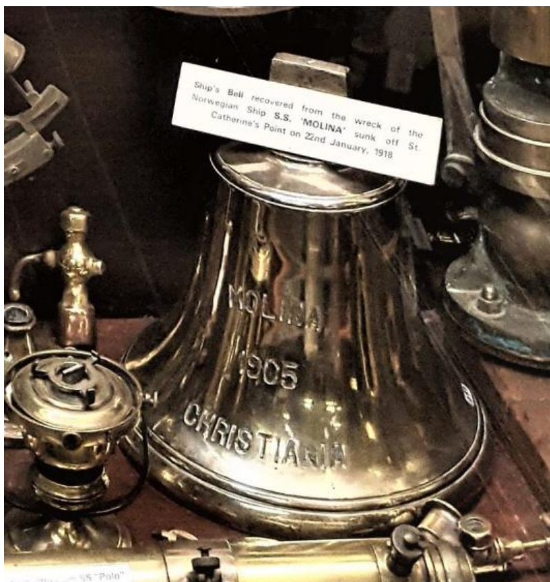
Figure 8: Ship's bell on display at the Shipwreck Centre and Maritime Museum, Isle of Wight